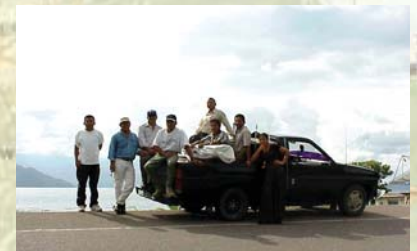
above: A group from Lago de Yojoa that heard the Message from the radio broadcast.